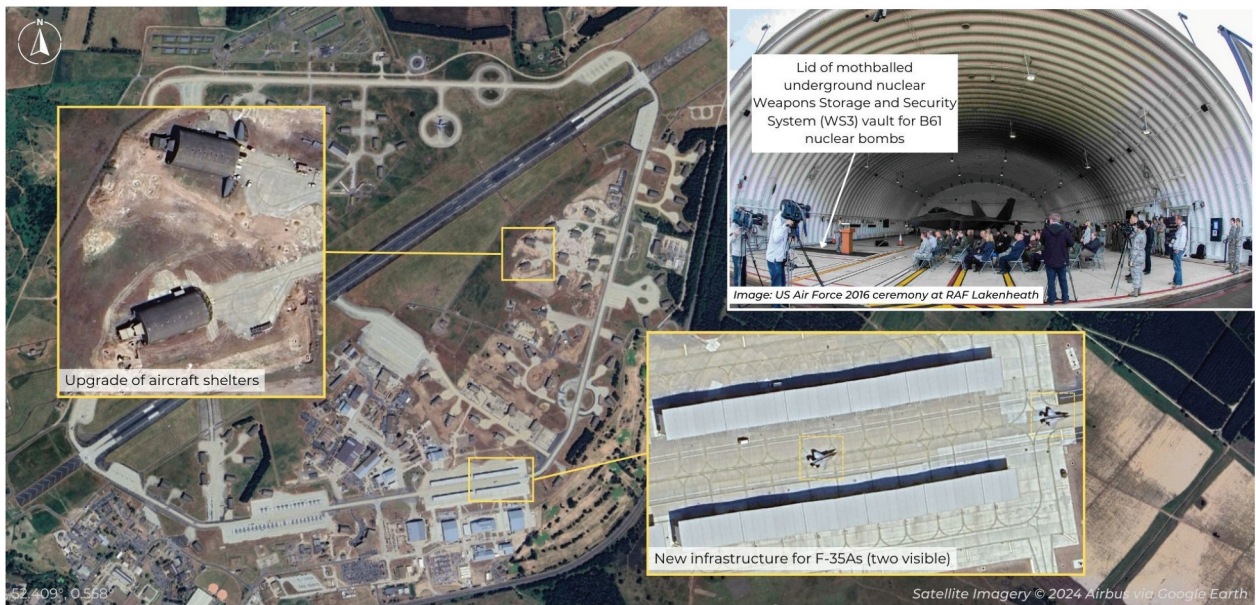
Figure 3. US Air Force budget document describes the proposed construction of a “surety dormitory” at Royal Air Force Lakenheath, United Kingdom.